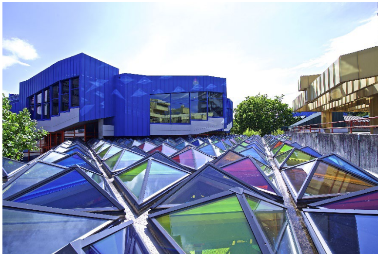
Coloured glas roof

13.30 Guided tour of the university "Art on the Building"