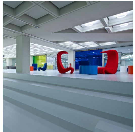
Our prize-winning library